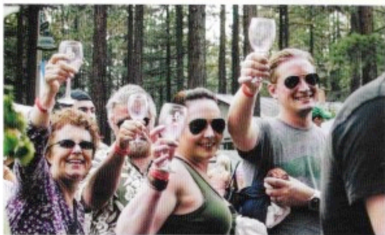
Sample the Sierra, courtesy photos