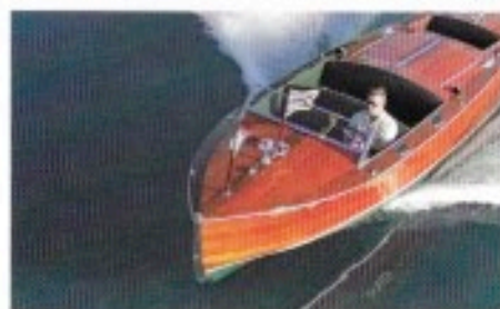
Power Play, a 1929 24' Hacker-Craft, photo by h2omark.com

The Tahoe Yacht Club hosts the 44 th annual Concours d'Elegance this August, a luxury boat show and contest featuring refurbished and classical wooden crafts. Held at Obexer's Boat Company in Homewood, the festival includes events such as an awards barbecue, opening night gala and dance, and ladies' luncheon.