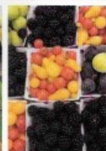
Tahoe City Solstice Festival, photos courtesy Tahoe City Downtown Association